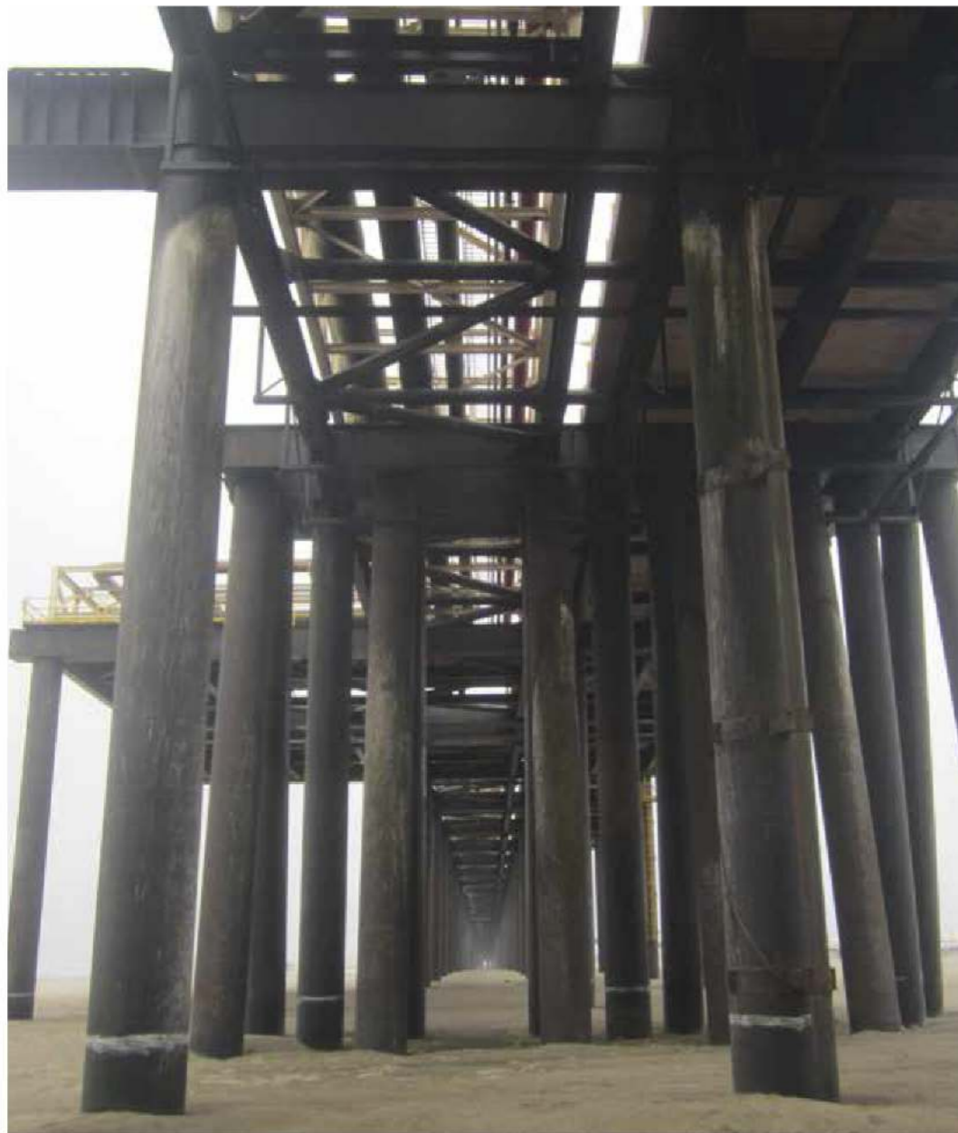
Pampa Melchorita Gas Export Pier and Jetty, Peru LNG

Baltoflake is simple and easy to apply by standard or 2 component spray. It can be applied up to 1500 microns in a single coat and it cures quickly. Application of a full protection system can be completed in a single day and the area coated can be used within a few hours.