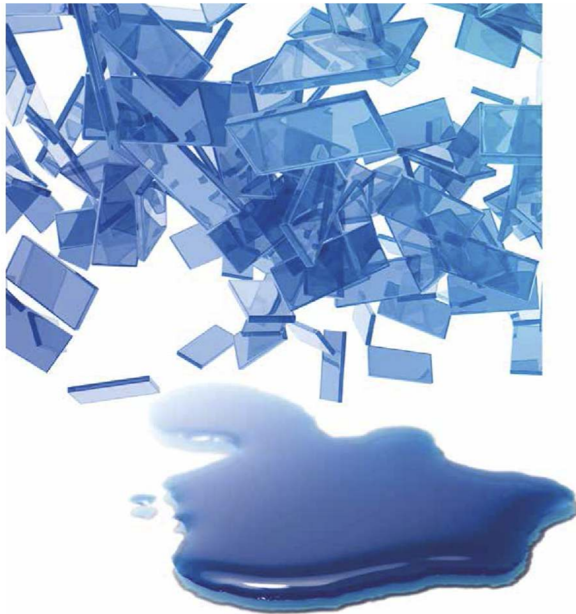
Glass flakes – graphical representation only

Baltoflake combines the strength of specially formulated polyesters with a unique glass flake reinforcement. This virtually impermeable barrier of glass flakes blocks the passage of moisture and oxygen. With its immense strength Baltoflake provides outstanding resistance to abrasion and water combined with good chemical resistance – making it ideal for industrial and offshore structures – for all exposed steelwork from splash zone to helicopter deck.